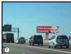
7 I-10 N/L 1000' East of 24th St.