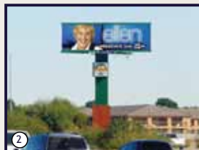
2 I-10 S/L 1500' W/O 91st Ave.