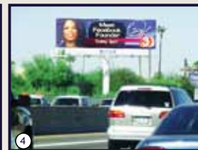
4 I-17 W/L 500' South of Indian School Rd.