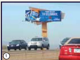
1 Loop 101 W/L Just N/O Glendale Ave.