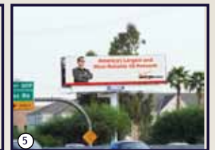
5 I-17 E/L Between Peoria & Cactus