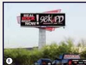
8 I-10 E/L Between Elliot & Guadalupe