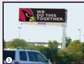
3 I-10 S/L Just E/O 51st Ave.