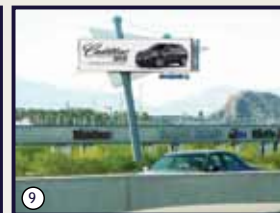
9 Loop 202 S/L Just West of Loop 101